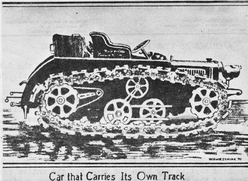
Car that Carries Its Own Track